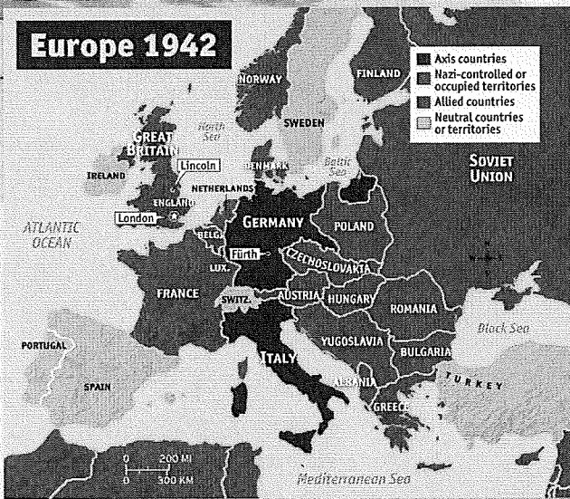
In 1942, the main Axis countries were Germany, Italy, and Japan. The main Allied countries were Great Britain, the U.S., the Soviet Union, and China.